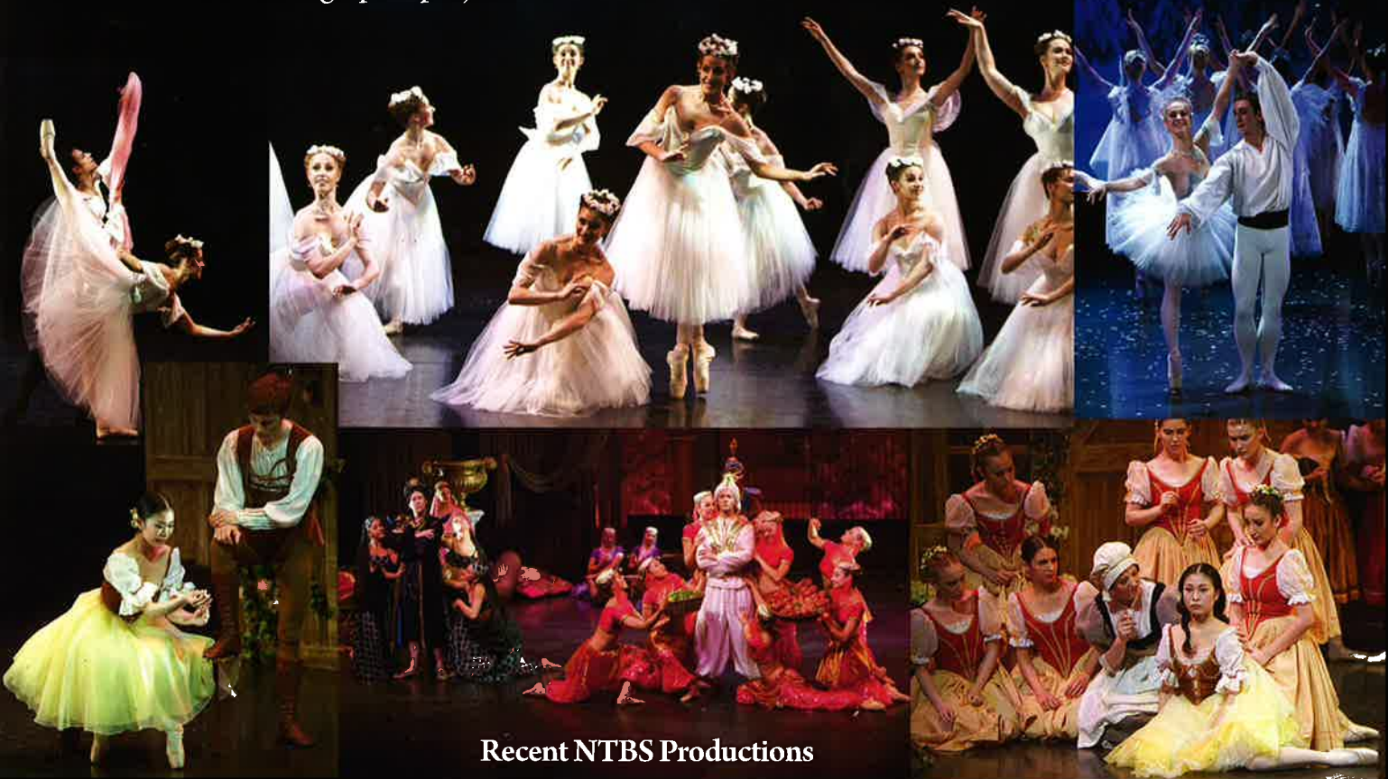
Recent NTBS Productions

Our facilities include the beautiful National Theatre itself as well as a studio theatre for rehearsals and in-house performances. We have 5 fully equipped, air-conditioned studios and a lecture room for tutorials. We have a large costume wardrobe and items from the collection are available for the students' own choreographic projects.